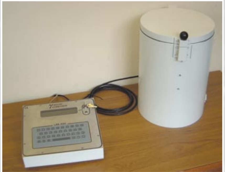
Measuring Chamber and Display Unit

The mains powered Display Unit provides the user interface and is housed in a case suitable for desk or bench top operation.