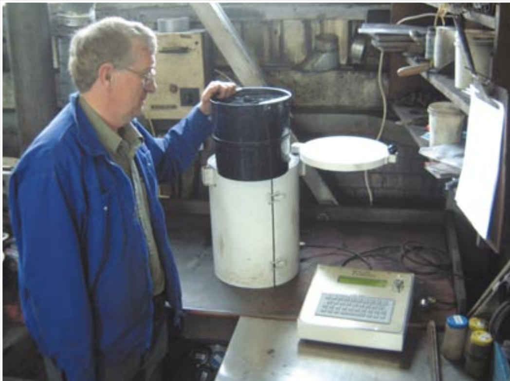
LabAsh in use